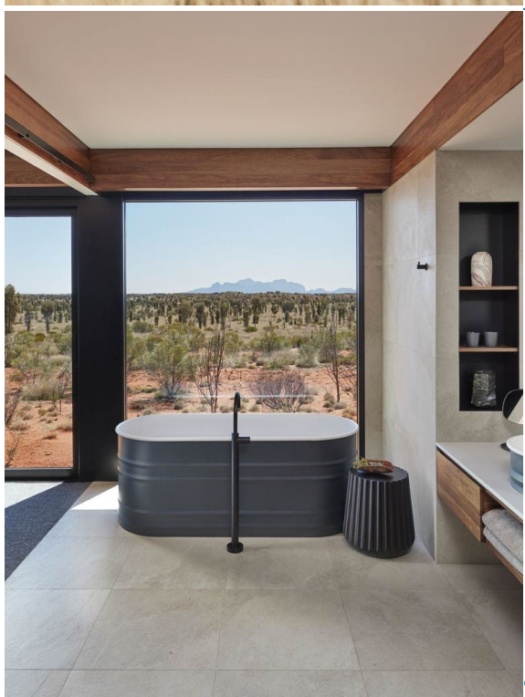
The tub with a spectacular view.

It takes two days for the skies to properly clear. The staff at Longitude celebrate by organising a tour of the Field of Light, Bruce Munro's large-scale light installation, then a perfect dinner beneath the stars. When it's over, they snuff the candles, and hand out those big plastic torches like your dad used to have, so guests can make their own way down the bush tracks, back to the lodge.