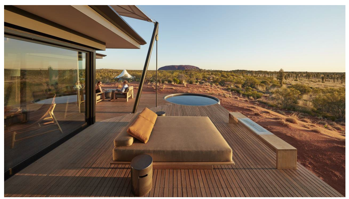
The campsite is uniquely positioned.

"You're going to have so much time to read, to write, to cook. You won't be rushing, rushing, rushing."