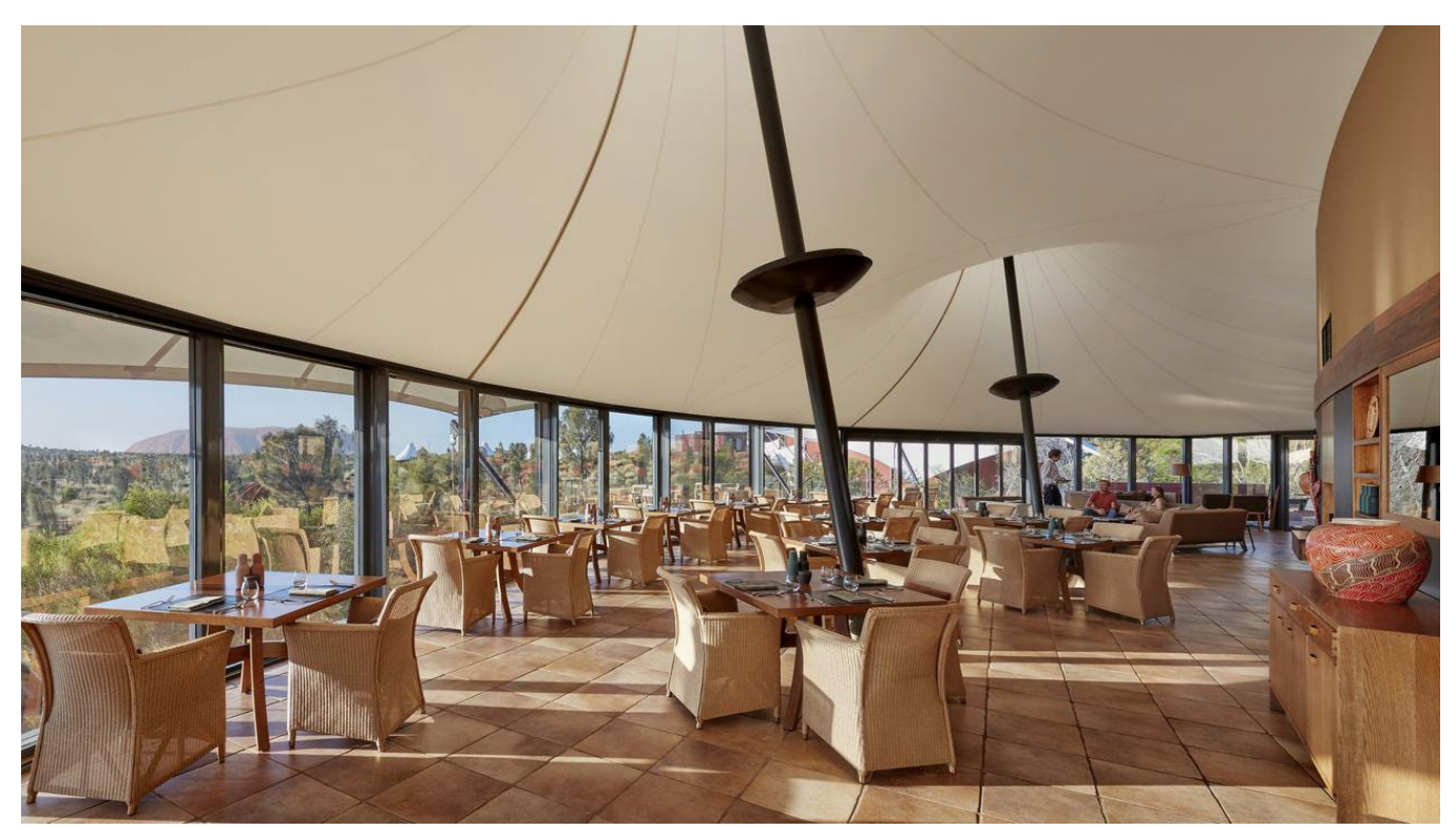
The dining room.

Longitude 131 – part of the Luxury Lodges of Australia collection – is a lodge discreetly positioned 15 minutes from the Uluru-Kata Tjuta National Park. It is luxurious, without being ostentatious. There is plenty to do: you can laze in the pool or take a tour of the desert. There are cocktails, canapes, and it's all very lovely. But it's not why I've come.