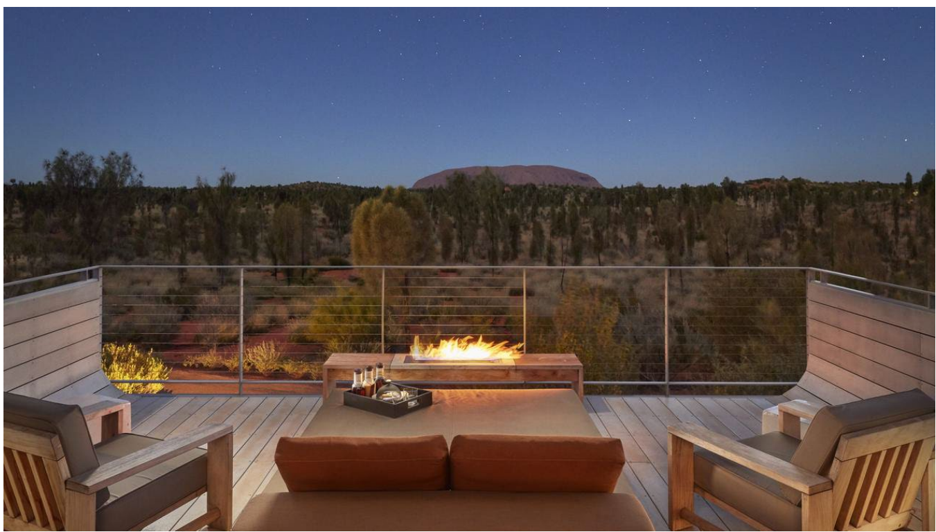
Stargaze in front of the fire.

I don't know, but then she is gone, and I am alone, the only person in the shadow of Uluru. It is so quiet I can hear my own heartbeat. I start to walk, and Uluru, she keeps me company, her presence at once sympathetic, timeless, and somehow true.