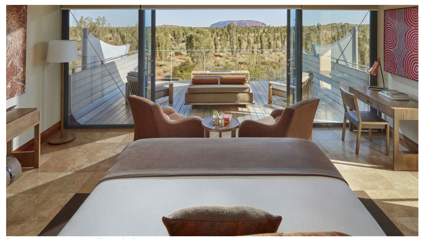
Room opens out to a private deck.

Before we leave, there is a final tour - a meander around the base of the rock. I trot to reception, pre-dawn, to find the other guests have decided to sleep in.