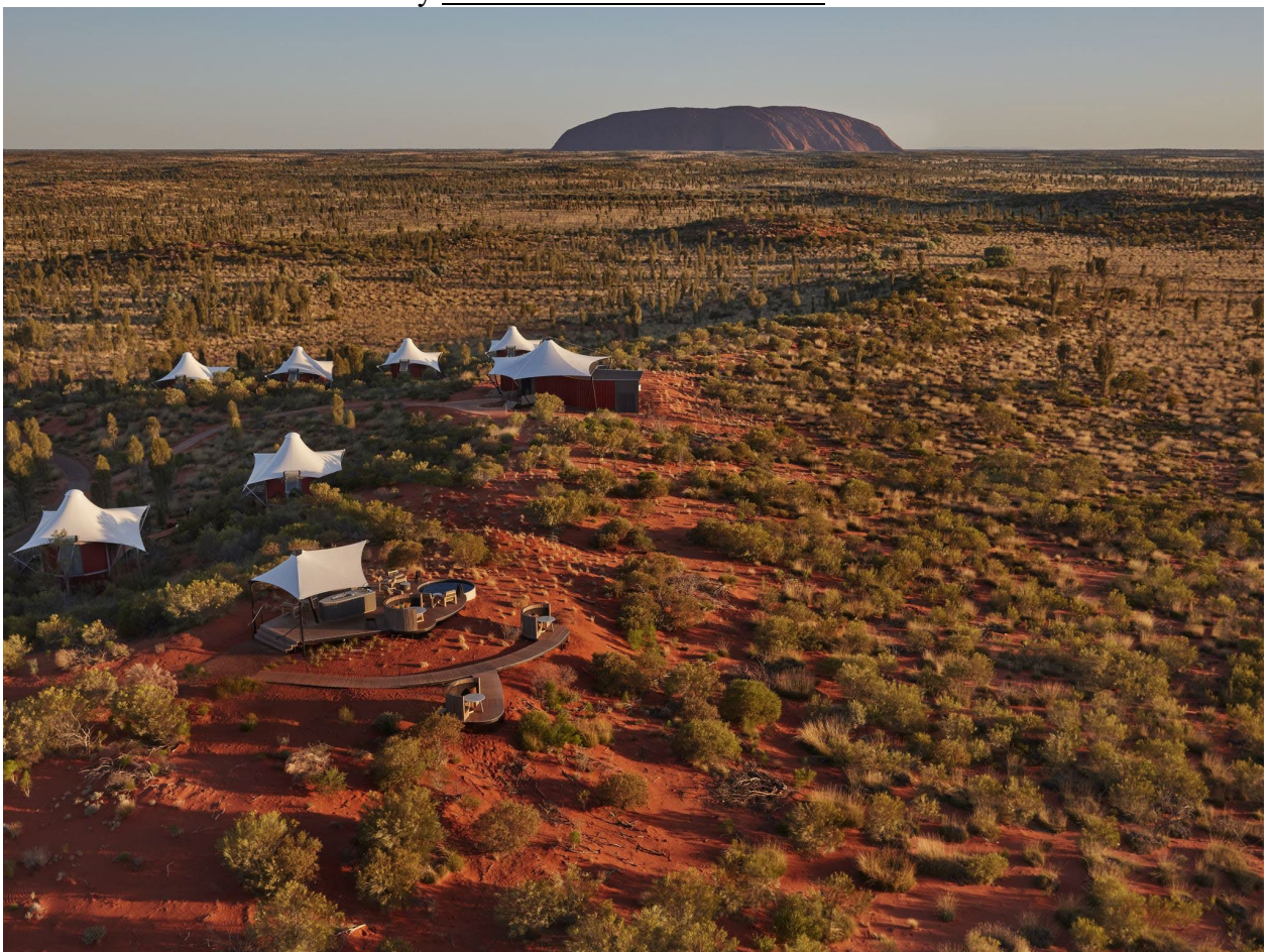
Longitude 131 Lodge, Uluru, NT. From The Weekend Australian Magazine May 5, 2023 4 MINUTE READ